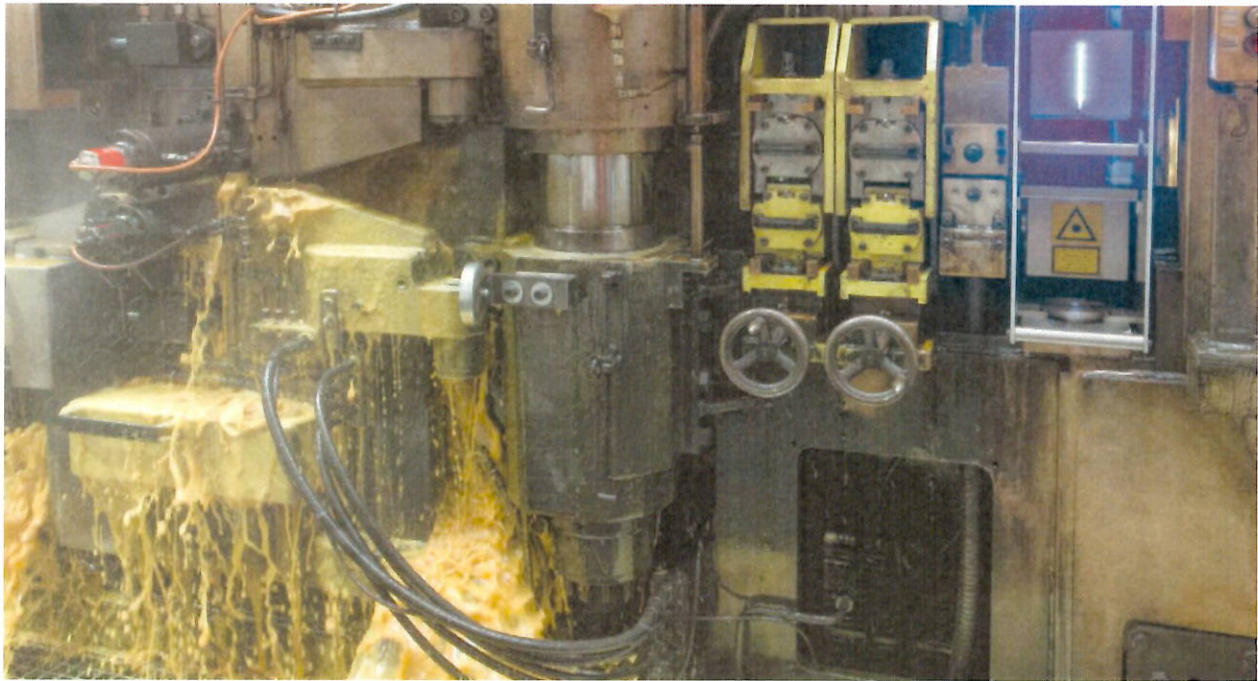
Only 200 mm length are required for the installation of the thickness measuring system

precision. The VTLG thus opens up completely new possibilities for quick and precise thickness control and for quality assurance. With an internal scanning rate of 50 kHz, the scalable analogue output provides the input signal for high-speed thickness control within milliseconds.