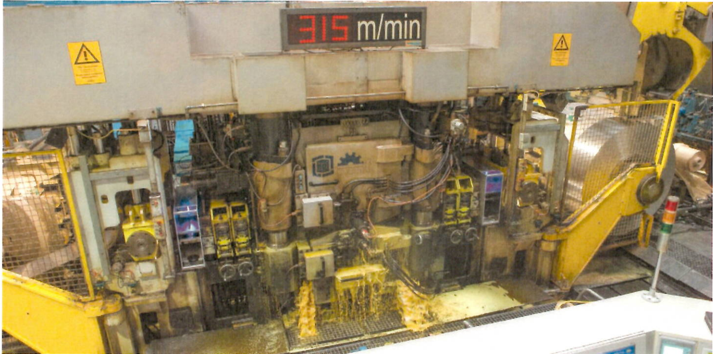
The 20-roll mill stand at the Hagen-Hohenlimburg site of BWS with the two thickness measuring systems (blue indicator lights) installed